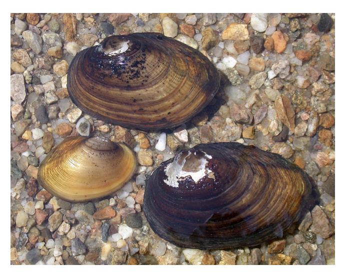
Two adult and one juvenile tidewater mucket from Mystic Lake.

In the summer of 2009, landowners around Mystic Lake began to see an unusually large number of mussels dying and washing ashore. This die-off began in early August and quickly escalated, reaching a peak by mid-month. The event was preceded by an unusually wet period during June and July. This was followed by particularly warm air temperatures and a rapid increase in algal turbidity in the lake. The